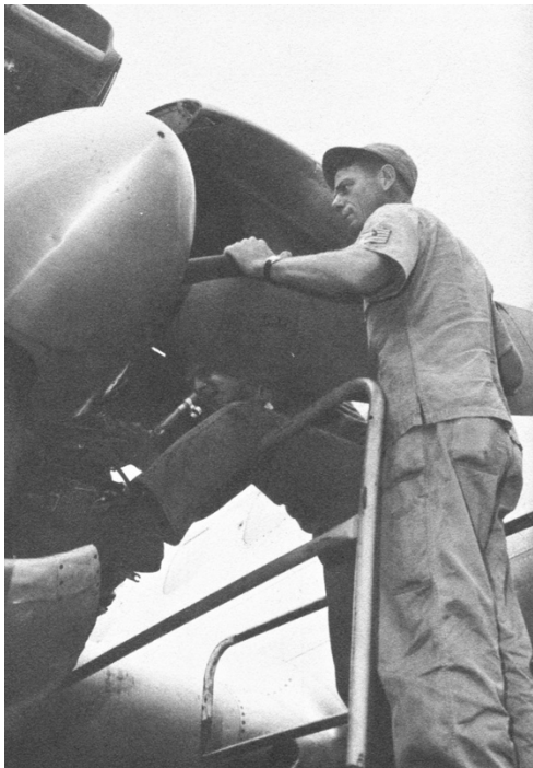
Post flight check